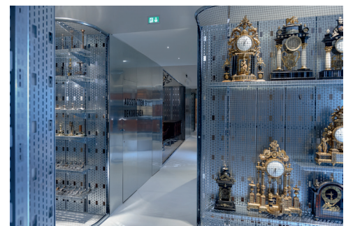
Permanent exhibition „Collected history“