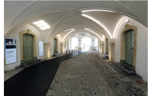
Path to lift and staircase

As the historic paving of the inner courtyard cannot be easily used by wheelchairs, a steel footbridge/ramp (grating) was installed.