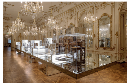
Permanent exhibition „100x Styria“