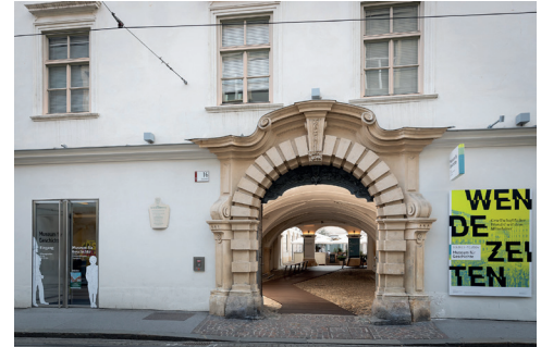
Barrier-free entrance and archway to inner courtyard