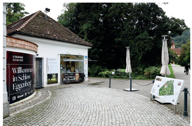
Cash desk at park entrance