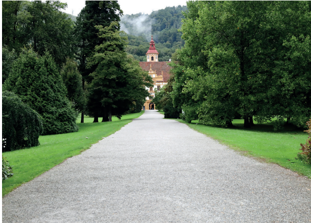
Path through the park