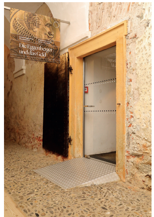
Access Coin Cabinet