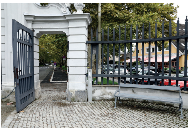
Parking spaces and park entrance