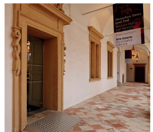
Entrance Alte Galerie