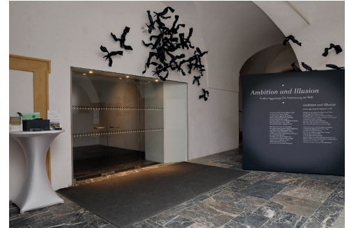
Exhibition rooms ground floor