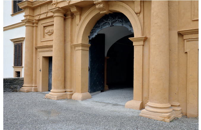
Entrance to Schloss Eggenberg