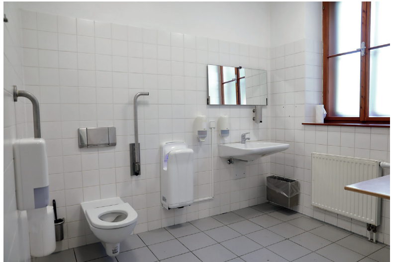
Barrier-free WC at park entrance