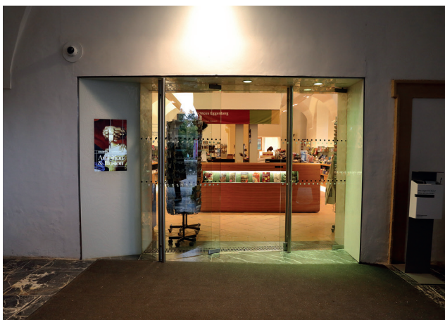
Cash desk and shop