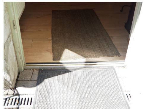
Access from Lendkai