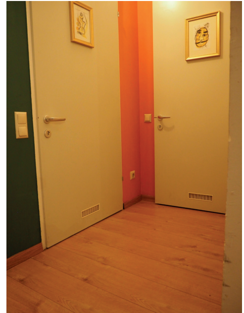
Access to accessible restroom