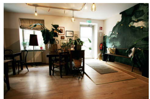
Ramp with a 5% slope