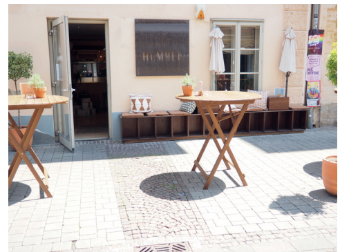
Access from Mariahilferstraße