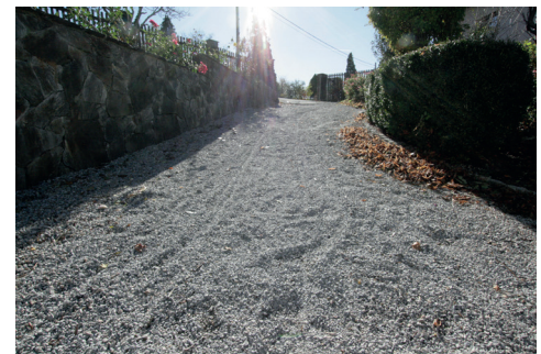
Access WC and outdoor dining area

The toilets are located in the basement without a lift. They are accessible via the outdoor dining area. To do this, you have to take the exit outside the building to the outdoor dining area, this has a slope and is heavily gravelled!