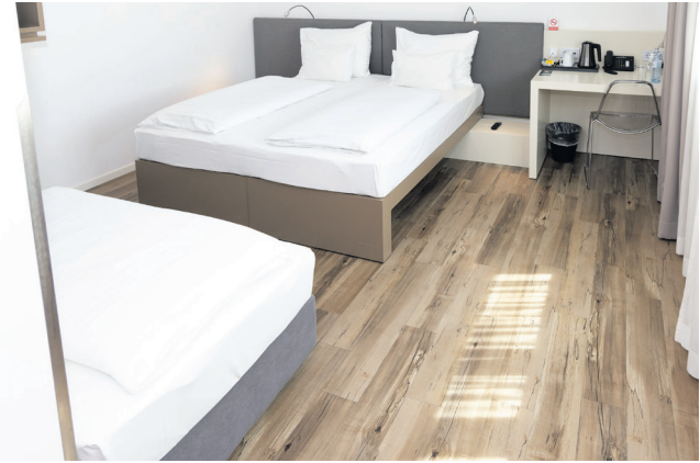
Accessible room no. 202