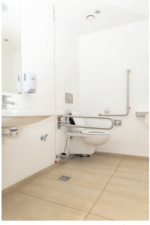
General barrier-free WC