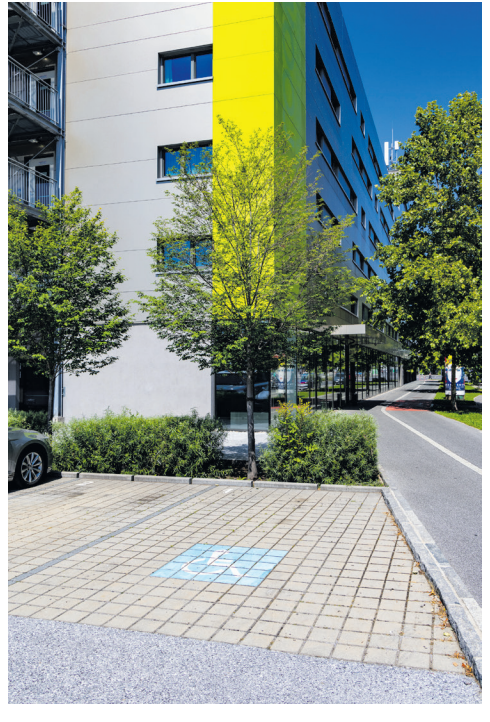
Barrier-free car park

Messeplatz 1/Messeturm 8010 Graz | Austria T +43 316 8075 0 www.graztourismus.at