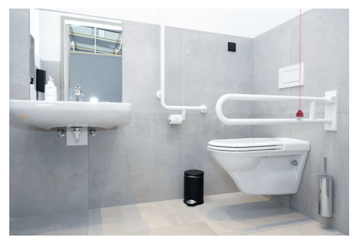
General barrier-free WC