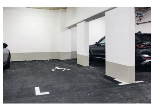
Barrier-free car park