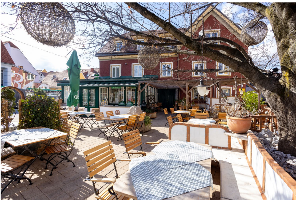
Outdoor seating area