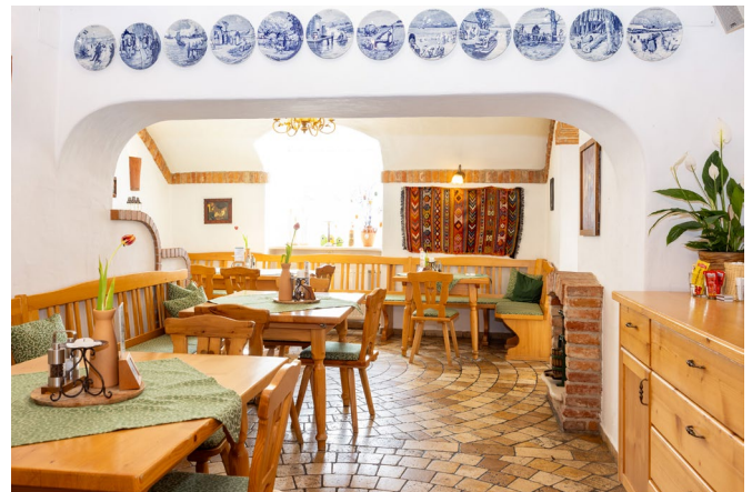
Accessible guest room