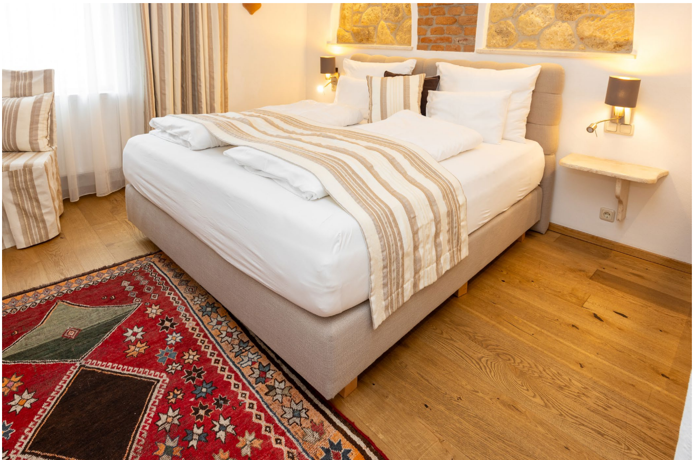
Room no. 209