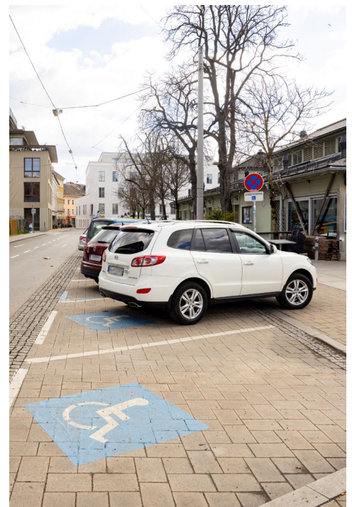
Public parking space