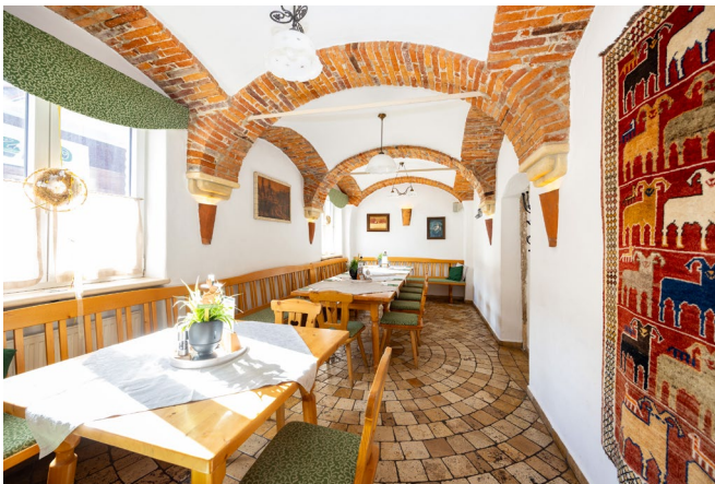
Accessible guest room