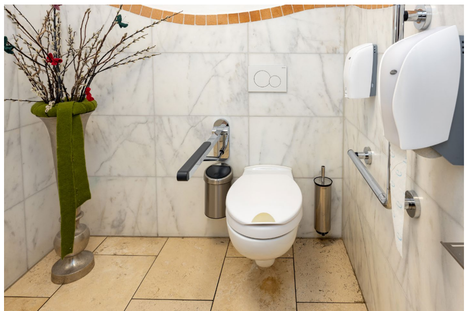
General barrier-free WC