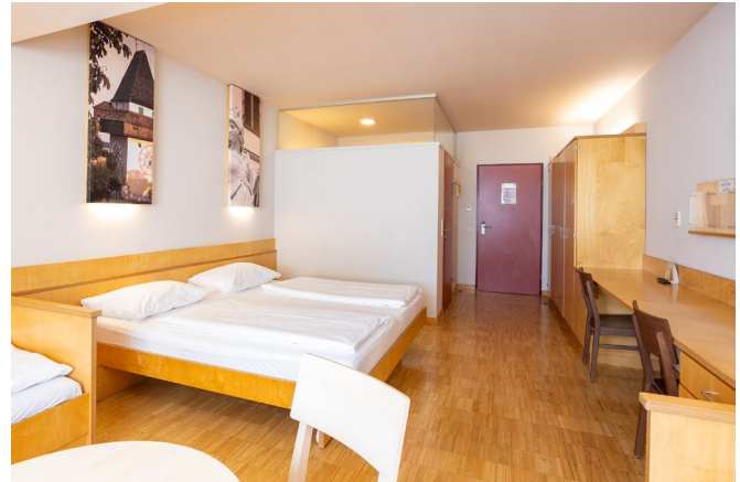
Room no. 154