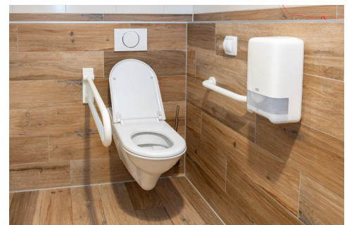
General barrier-free WC