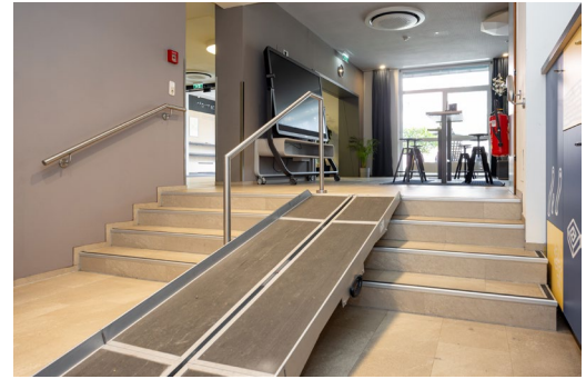
Mobile ramp to seminar room