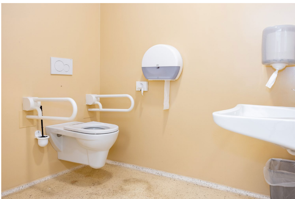
General accessible WC