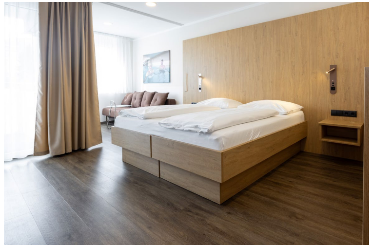
Room no. 3403