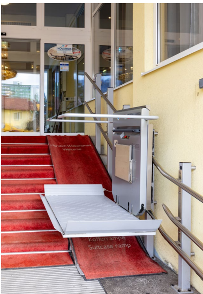
Entrance with stair lift