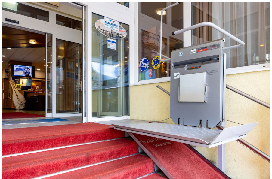
Entrance with stair lift