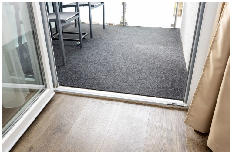
Access to balcony