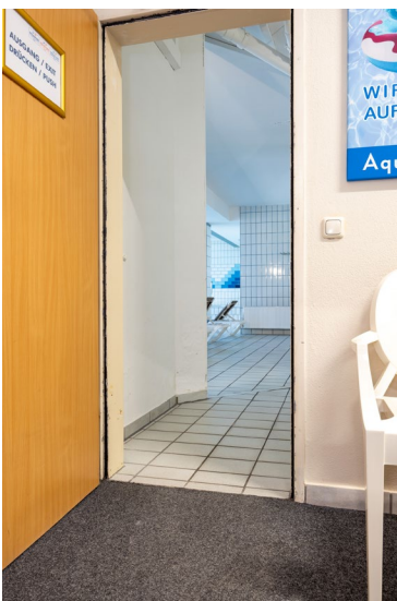
Access to wellness area (basement)