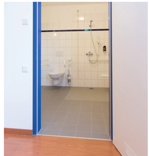
Entrance to bathroom