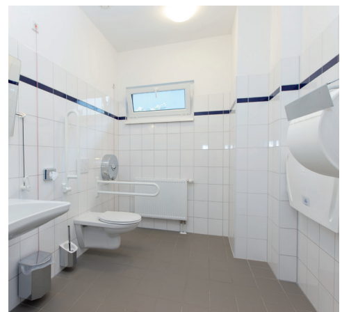
Accessible WC on ground floor