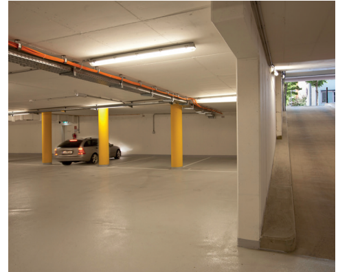
Underground car park