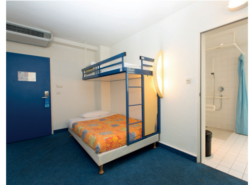
Room with entrance to bathroom