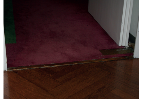
Crossover to WC