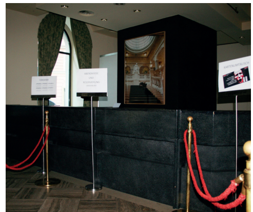
Evening box office