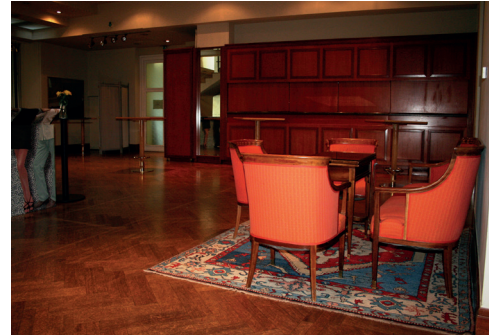
Foyer and bar