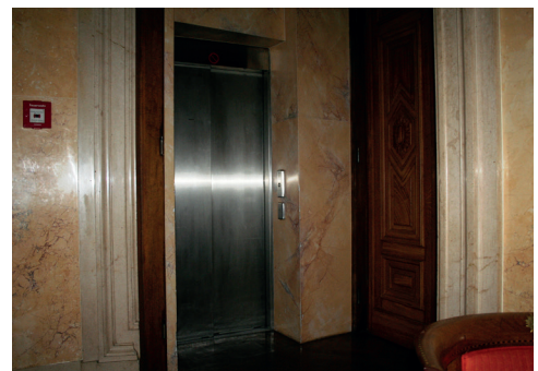
Lift exit to the event space